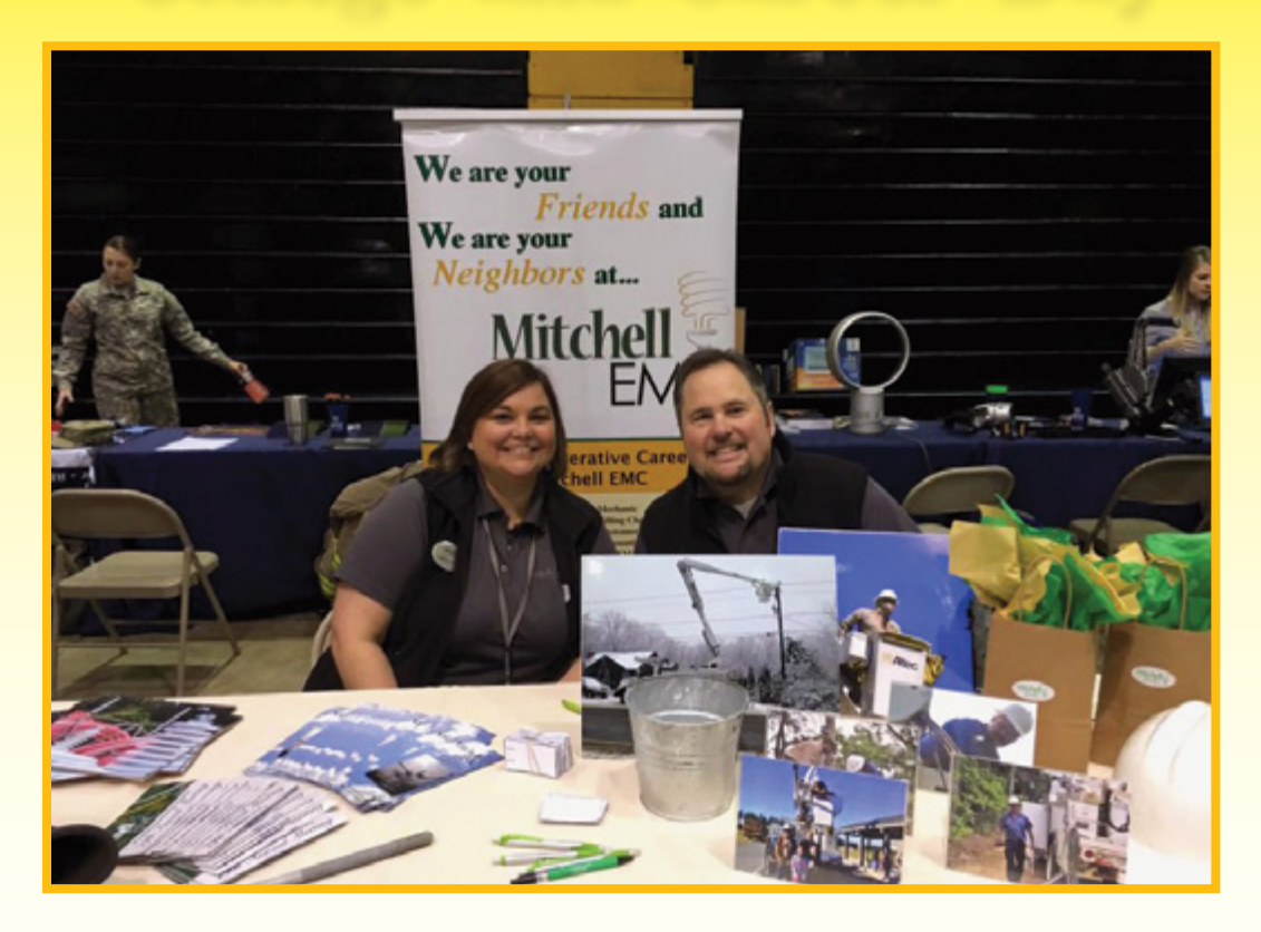
Worth County High School held their annual College and Career Day on February 26, 2016, at Worth County High School. Over 300 students attended.